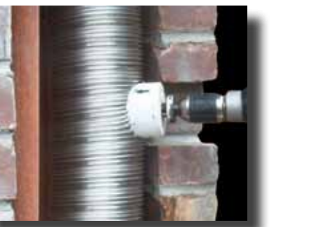
7. If needed, cut Universal Takeoff hole into VENTINOX.