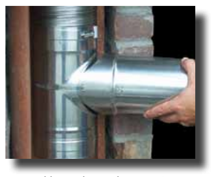
4. Feed liner through Snout's drawband, then fasten.