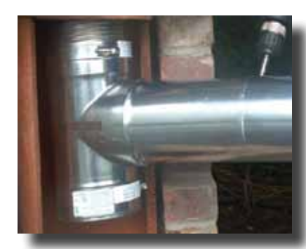
9. Make a final connection between flue outlet and heater.