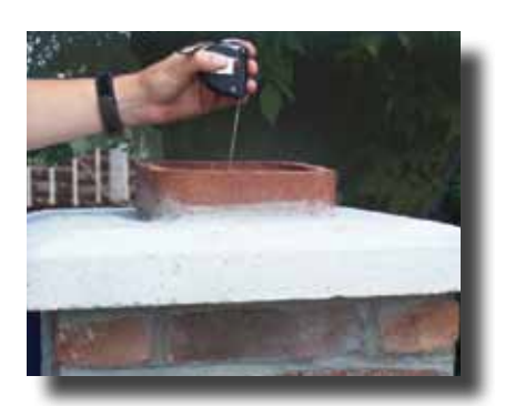
1. Measure from chimney top to flue inlet. Add 6", then cut VENTINOX.

The VENTINOX® System is designed to upgrade substandard chimneys and/or to match vent size to the requirements of heating appliances. The following is a brief overview of a typical installation. Detailed installation instructions can be found at www.duravent.com.