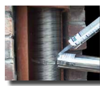
8. Fasten and seal Universal Takeoff to VENTINOX.